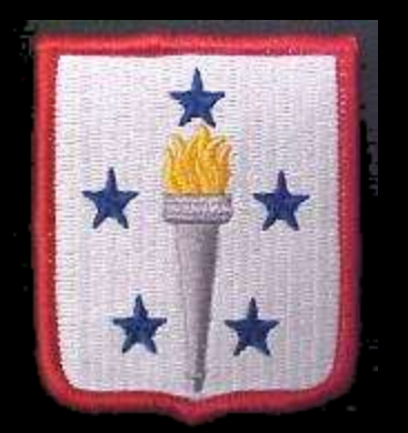
U.S. Army Sustainment Center of Excellence